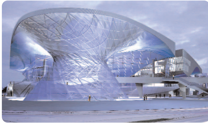
Outokumpu stainless 316L and 304 add to the aesthetic and functional appeal of the new BMW Welt in Munich, Germany.

Its shape has been described as a “cyclone,” with a stainless steel and glass facade that swirls into a dramatic helical structural support for its floating “Cloud Roof.” More than 500 tons of stainless coil and sheet in 316L and 304 from Outokumpu were used in the construction of “BMW Welt,” the new futuristic showroom near the carmaker’s Munich, Germany headquarters. (In English, the building’s name translates to BMW World.)