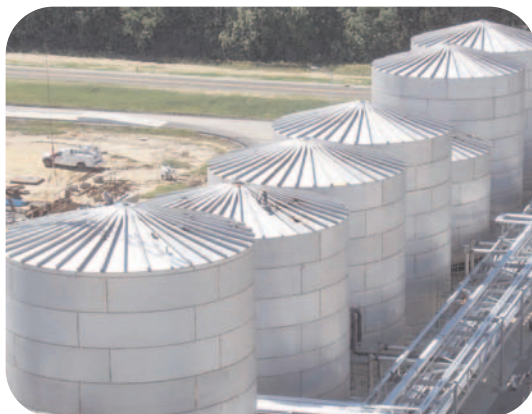
LDX 2101 is being used in fermentation tanks at this bio-fuel facility in Lima, Ohio.

T hey are the most visible part of an ethanol plant: enormous pairs of stainless steel outdoor standing structures, called fermentation tanks.